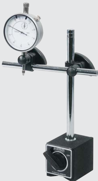
Figure dial gauge and gauge stand